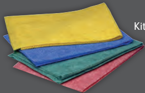
Kitchen Equipment Cleaning

A full array of tools make cleaning fast and easy. Specialty cleaners complete the single-use packets range.