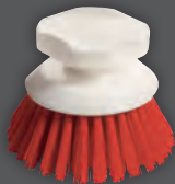
Manual Ware Cleaning